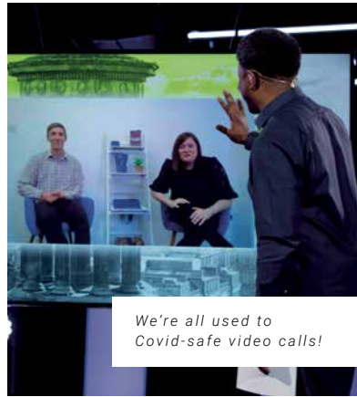
We're all used to Covid-safe video calls!