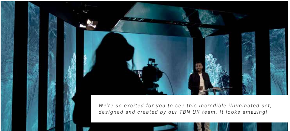
We're so excited for you to see this incredible illuminated set, designed and created by our TBN UK team. It looks amazing!