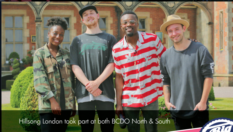
Hillsong London took part at both BCDO North & South