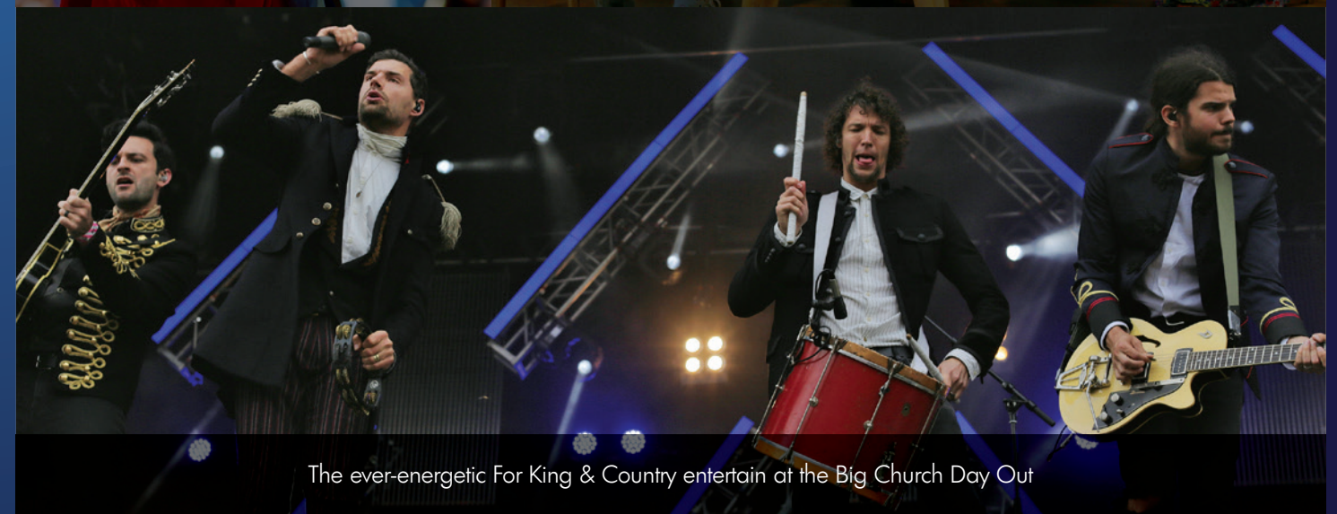
The ever-energetic For King & Country entertain at the Big Church Day Out