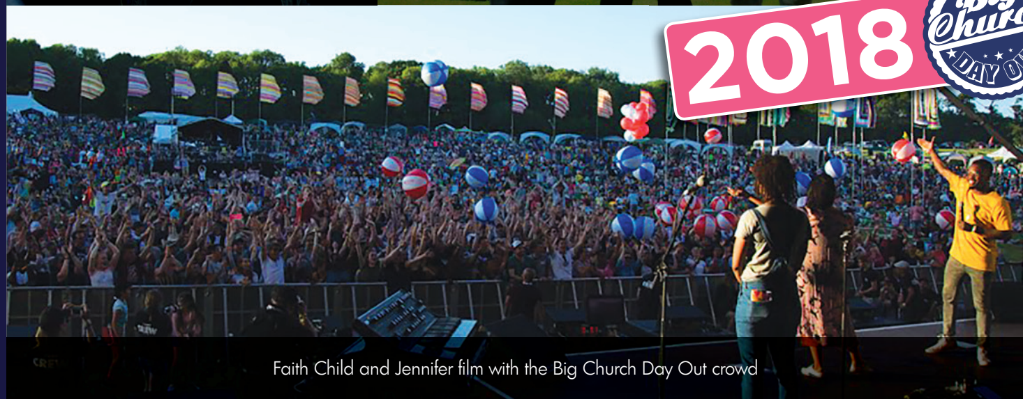
Faith Child and Jennifer film with the Big Church Day Out crowd