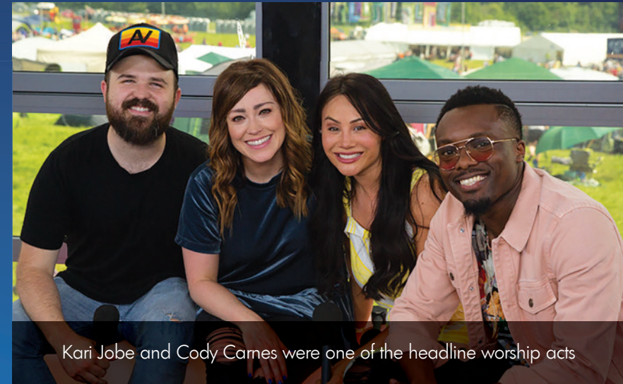
Kari Jobe and Cody Carnes were one of the headline worship acts