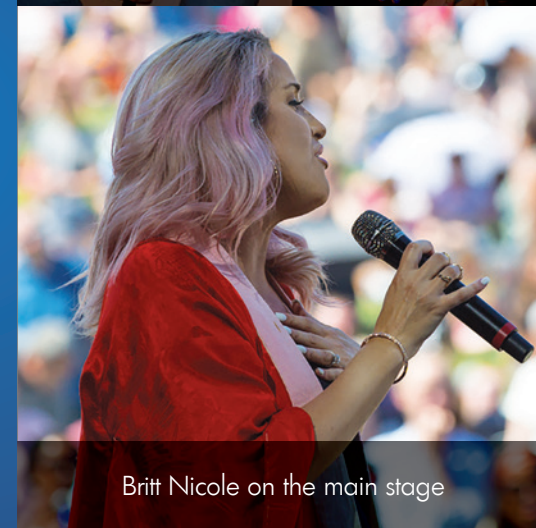
Britt Nicole on the main stage